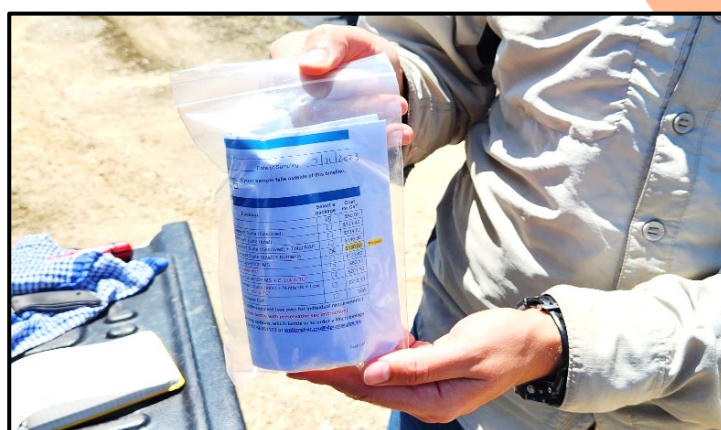
Figure 4. Affixing the sample collection form to the sample bag and preparing the sample for delivery to the laboratory.