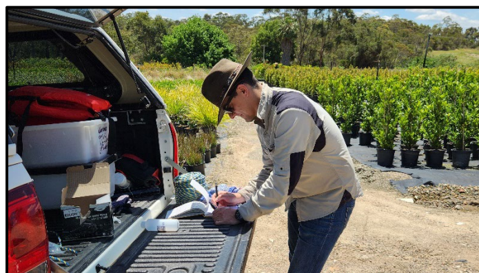
Figure 1. Filling out the sample collection form.