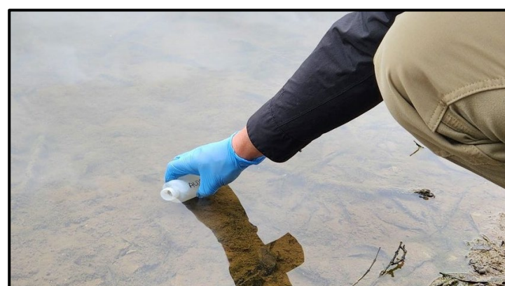
Figure 3. Collecting a sample from a shallow water column.